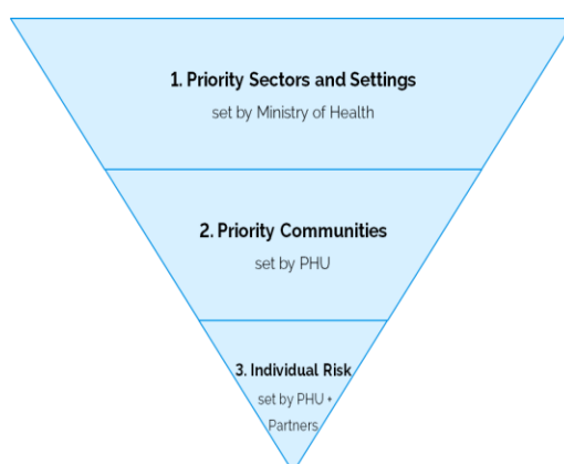
Fig. 1 Approach to Prioritization

A stepwise approach to prioritization has been developed which considers multiple factors including the sectors and settings that people work in, local and community factors as well as individual factors. Each step should be performed in sequence to gradually refine from the broad sector/setting level down to the individual level.